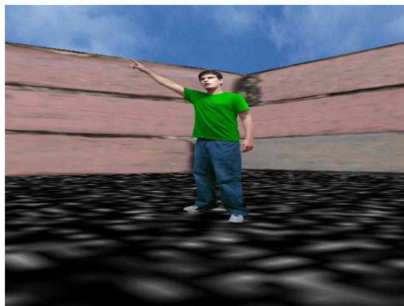
Figure 2. Screen shot of Sample Experiment 2, showing sprite (person with hand extended).

The other kind of object requiring configuration in our experiment is the sprite (see Fig. 2). In contrast to the boundaries, whose rendering includes both scaling to convey proximity and deforming to convey orientation, the sprite is rendered only to convey distance; its display does not vary with orientation and always faces the Eye (concerning which, see below).